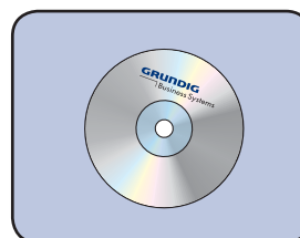
Includes DigtaSoft PC software and ...