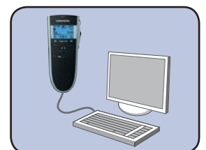
... USB audio for Dictating on the PC